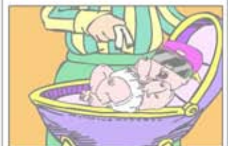
FLAVANAISE - TBA 2-D Flash Animation