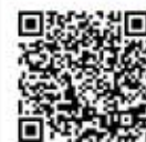
DiGiorno Mocomercial - 2010 2-D Animation