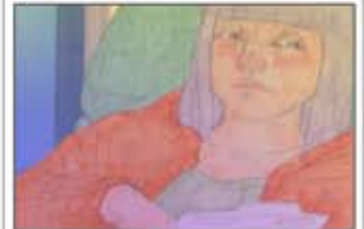
OFFTRACK - TBA Hand Drawn Animation